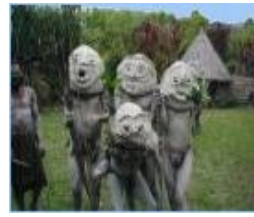
PNG Mud Men