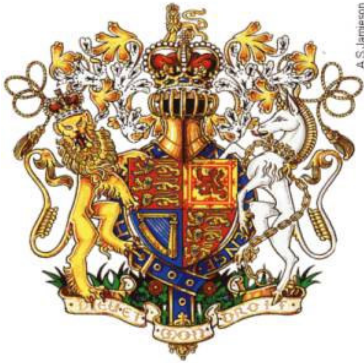
Royal British Coat of Arms