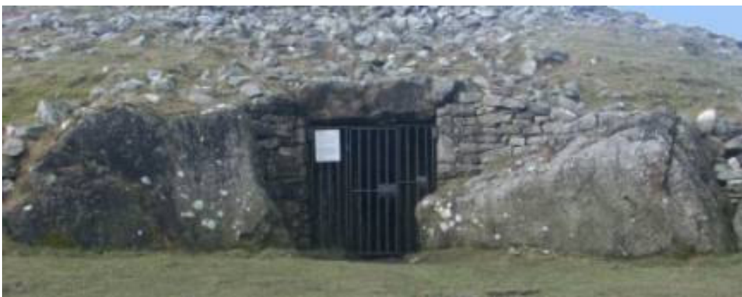
Ollamh Fodhla known as the “Tomb of Jeremiah”