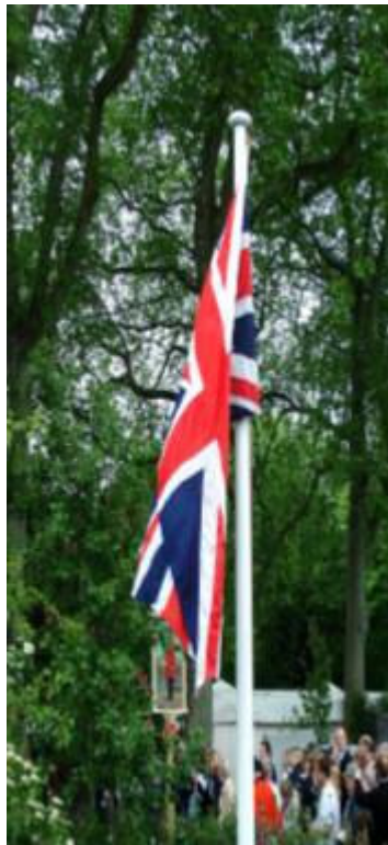
Union Jack (Union of Jacob)