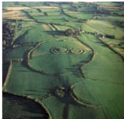
Royal palace at Tara, Ireland, Capital of Brega. (The first “overturn” from the Land of Palestine to Ireland of the “Stone of Destiny”. Taken there by the Prophet Jeremiah.)

A scripture in Ezekiel 21:27 says “I will overturn, overturn, overturn, it: and it shall be no more, until he (Jesus Christ as “...King of Kings and Lord of Lords...” – Revelation 19:16 ) come whose right it is; and I will give it him.” The Throne of David went from the Middle East to Ireland via Jeremiah (1 st overturn); from Ireland to Scotland (2 nd overturn) and then from Scotland to England (3 rd overturn).