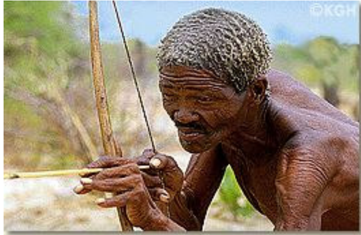
The African Bushmen