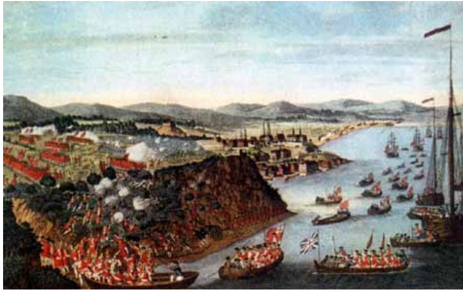
The Landing of the British forces at Quebec

Even in New Zealand, a similar, but much smaller event, awaited some French immigrants. In 1838, French whalers signed an agreement with the local Maoris in Akaroa Harbour in the South Island. They then returned to France and shortly after, with a ship full of immigrants, set sail to claim that region for France. While they were on the high seas, the Treaty of Waitangi was signed during 1840 by over 500 chiefs, including the two local chiefs in Akaroa, for the whole of New Zealand. This Treaty was between all the Maori population of New Zealand and Queen Victoria of the British Empire. When the French settlers arrived in August 1840, they found they were too late – New Zealand was a British Colony. The British Authorities in New Zealand said they would acknowledge the original agreement signed between the French and the local Maori tribe in Akaroa Harbour, on one condition. The French settlers must come under British Sovereignty. They had come a long way, so they agreed and the rest is history. The following is an extract from the Akaroa Civic Trust, New Zealand:-