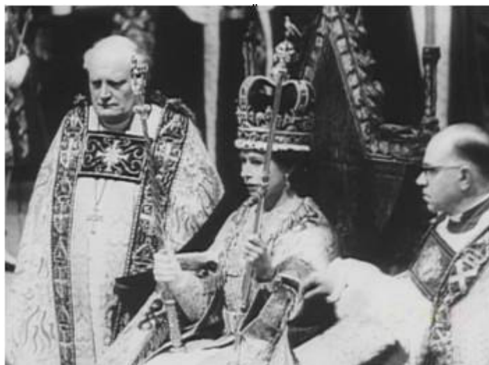
The Coronation of the Queen, who is seated directly on the Stone of Destiny, in the Edwardian Coronation Chair in Westminster Abby, London. The last “overturn”, to England by Edward the 1 st (“Longshanks”).

I realize as I write on this great subject, I can only scratch the surface. I would love to finish by talking about the “great nation” of Genesis 48:19 (“... he (Manasseh) shall also become a great people ”...). Let us have a quick look at the story of the United State of America.