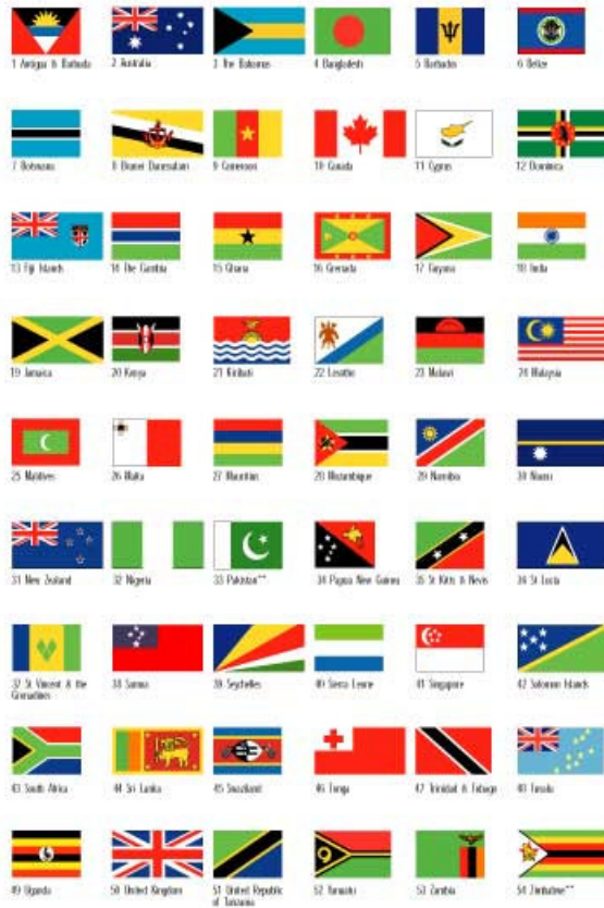
The Flags of the Commonwealth of Great Britain