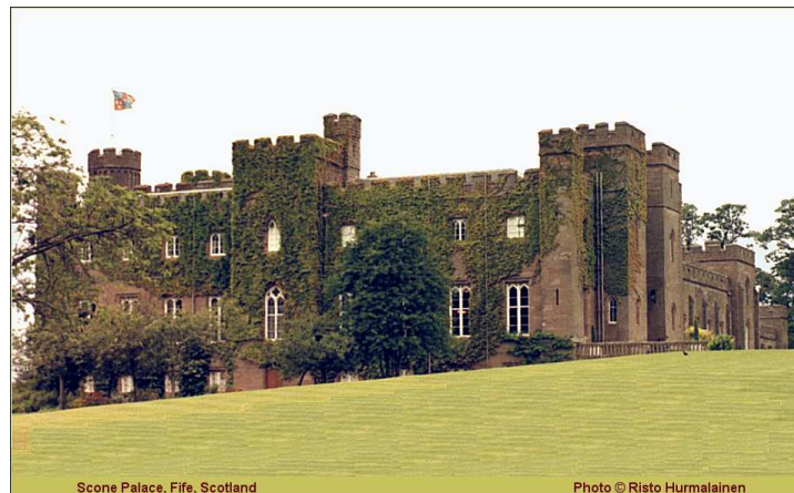
Scone Palace, Fife, Scotland (Original Scottish home of the Stone of Destiny) the second “overturn” from Ireland to Scotland with King Fergus.

“The origin of the name Fergusson or Ferguson, "son of Fergus" (MacFhearguis in Gaelic), is shrouded by the mists of time. Medieval historians recorded a tradition that the founder of Scotland's monarchy was a Fergus who lived in Ireland about 300 B.C. Historical research dating from the 13th century confirms that by 500 A.D. the Scots under King Fergus MOR had left Northern Ireland and became established in Dál Riata, now Argyll. From Fergus MOR, with a few early exceptions, descend all subsequent kings and queens of the Scots, including the present Queen of Britain. St. Columba of Iona (6th century A.D.) was a scion of Fergus MOR's royal line.”