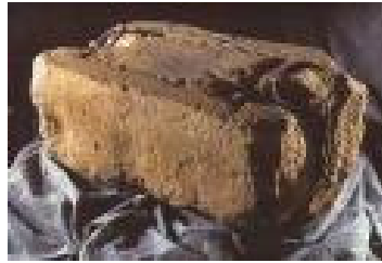
Stone of Destiny

Before I leave this huge and amazing subject, I must mention the Stone of Destiny