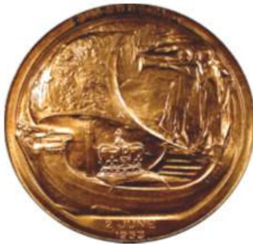
Coronation Medal – June 2 nd 1953.