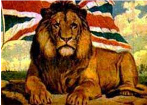
The British Lion