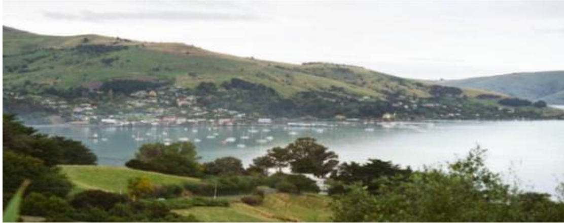
Akaroa Harbour Today

The French settlers stayed on, making Akaroa the first colonial settlement in New Zealand's South Island, but their colony was not to be French. Nevertheless, the French left a mark on Akaroa, laying out its charming narrow streets and planting many walnut trees and roses whose descendants survives through to today."